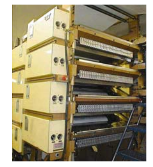
All QuadStacks, Quadra-Color, and Web Leader units.